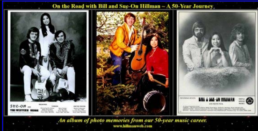
Photo Collage Archive