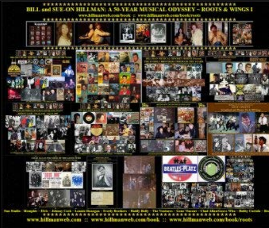
Roots and Wings Tributes to artists who have influenced our music