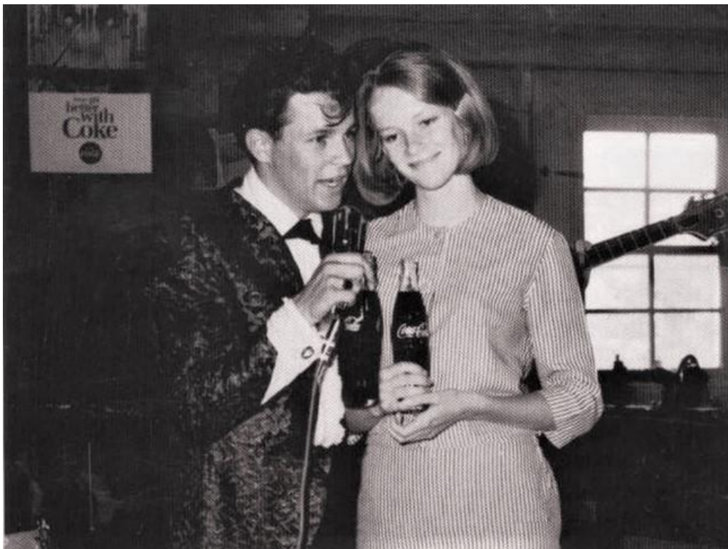
"Things Go Better With Bobby Curtola" 1964 - Chatham Daily News, June 2016

September 1963 saw the launch of the biggest advertising campaign for Coca-Cola, at the time. In the U.S.A., The Limelites got the nod to perform the "Things Go Better With Coke" jingle on radio and television, while in Canada, this honour was given to the hottest star in the country, Bobby Curtola. While The Limelites recorded their jingles in Hollywood at the Radio Recorders Studio, Bobby was in Nashville belting out his versions with the help of the Jordanaires. There is some speculation that Bobby Curtola's "Things Go Better With Coke" jingle was aired on Canadian radio BEFORE The Limelites version was released in the States.