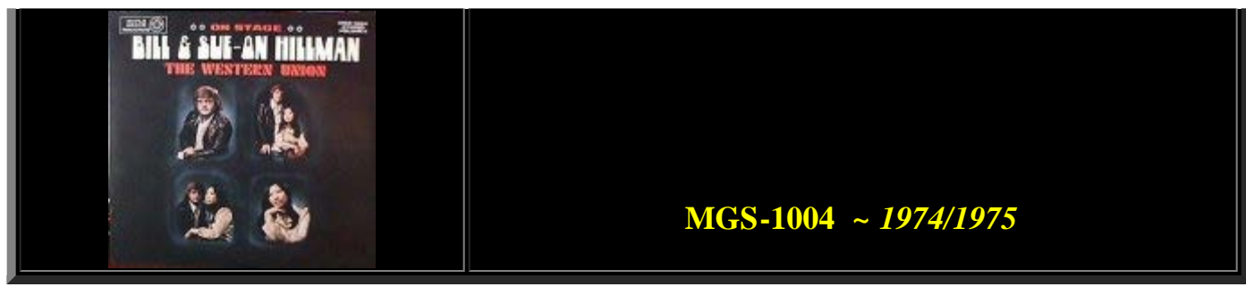
<u>ALBUM 4</u>: Credits ~ Photos ~ Anecdotes ~ Lyrics ~ Reviews ~ MP3 Files www.hillmanweb.com/albums/album04.html