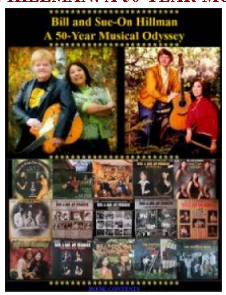
BOOK COVER BOOK CONTENTS