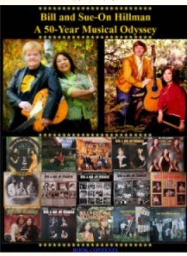
BOOK COVER BOOK CONTENTS