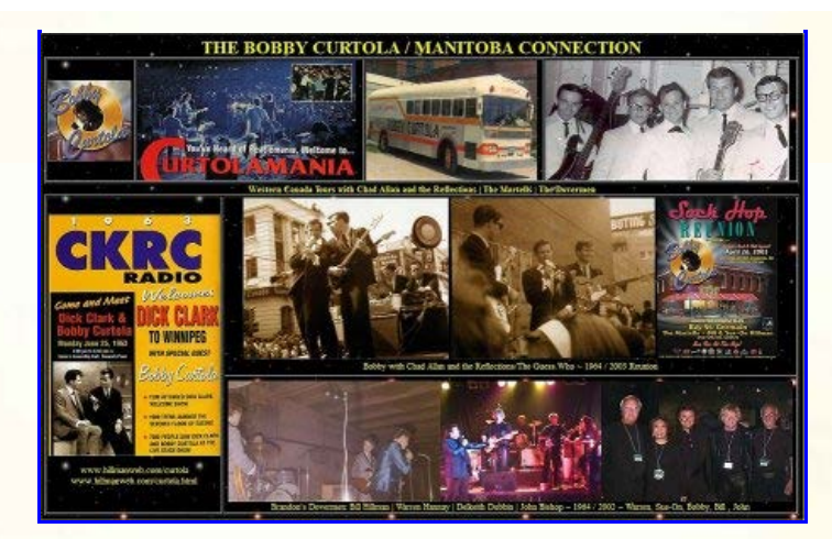
www.hillmanweb.com/cards/21/boball.jpg Rockin' with Bobby Curtola

Photo Source: Hillman Photo Collage Archive