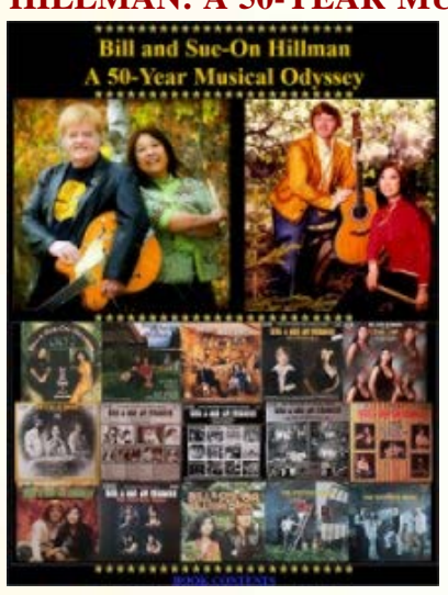
BOOK COVER BOOK CONTENTS